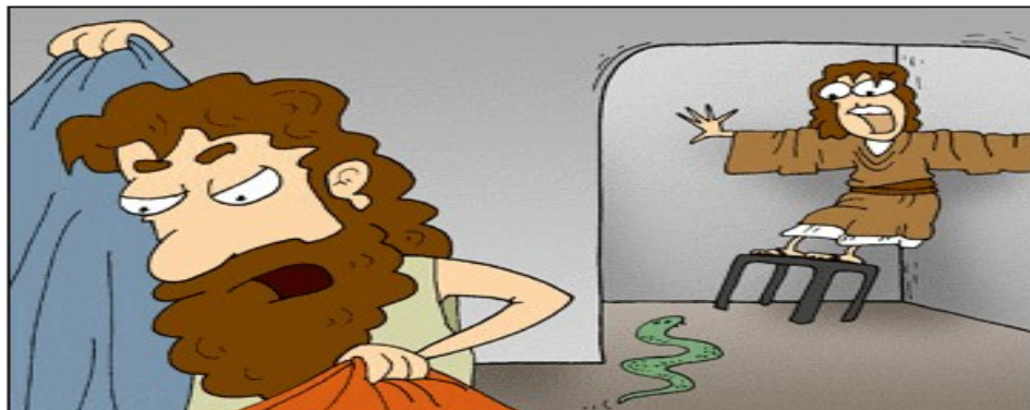
ZIPPORAH, HONEY, HAVE YOU SEEN MY STAFF?